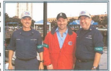
Can-Am Team #13

The 7th Annual International Search and Rescue (ISAR) competition was hosted in October, 2006 by the United States Coast Guard Auxiliary.