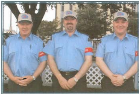
NL Team #6

The 7th Annual International Search and Rescue (ISAR) competition was hosted in October, 2006 by the United States Coast Guard Auxiliary.