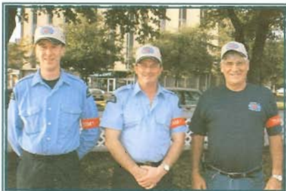
Canada Team #1

In addition to the four team members from District 1, CCGA (NL) Inc. was asked to send a member to ISAR 2006 to participate on 'Team Canada'. The 'Team Canada' members are made up of 4 members from each of the 5 respective CCGA regions across Canada.