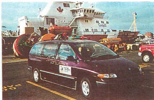
"The Executive Chariot"

In February, 1998 the National Council of the Canadian Coast Guard Auxiliary and the National Search and Rescue Directorate secured funding for the purchase of a vehicle for the Canadian Coast Guard Auxiliary (Newfoundland) Incorporated. These funds were used to purchase a new 1998 Dodge Grande Caravan from Dodge City/Royal Garage in St. John's.